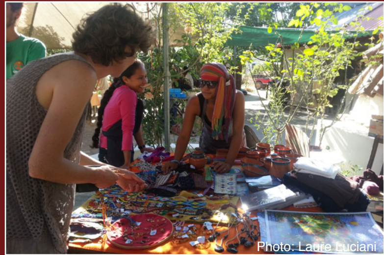
Craft market with local products from the base-stations